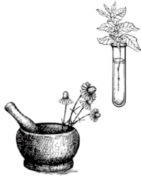
Step 2 Extraction 향기물질 포집/추출