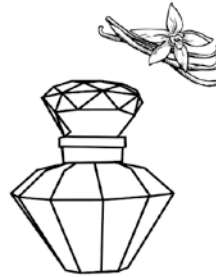
Step 7 Flavor / Fragrance 제품화