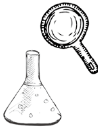
Step 6 Quality Control 품질 규격설정