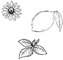
Step 1 Collection 향기식물/식품향기채집